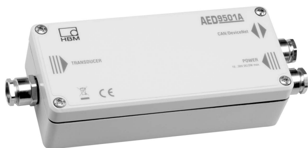
AED9501A Basic device